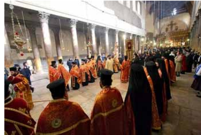
Orthodox procession in the Nativity Church

As one might imagine, Christmas in Bethlehem, the city where Jesus was born, is a major event. Some of Bethlehem's Christmas celebrations would be familiar to us - the streets are strung with Christmas lights, there is a Christmas market and Christmas plays are performed.